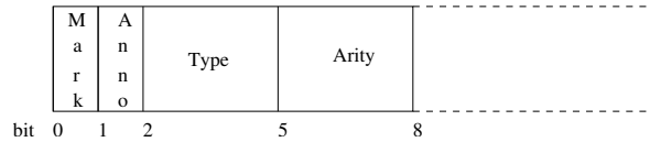
Figure 1: The header layout